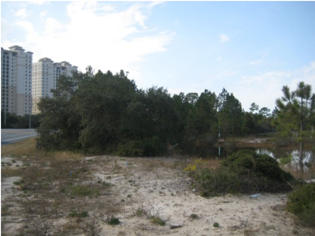
Photo 2 Looking southwest along eastern boundary