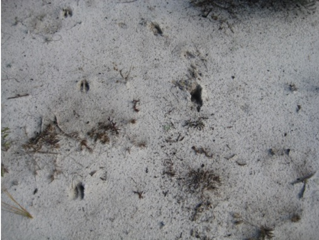
Photo 11 View of deer tracks that are abundant on the site