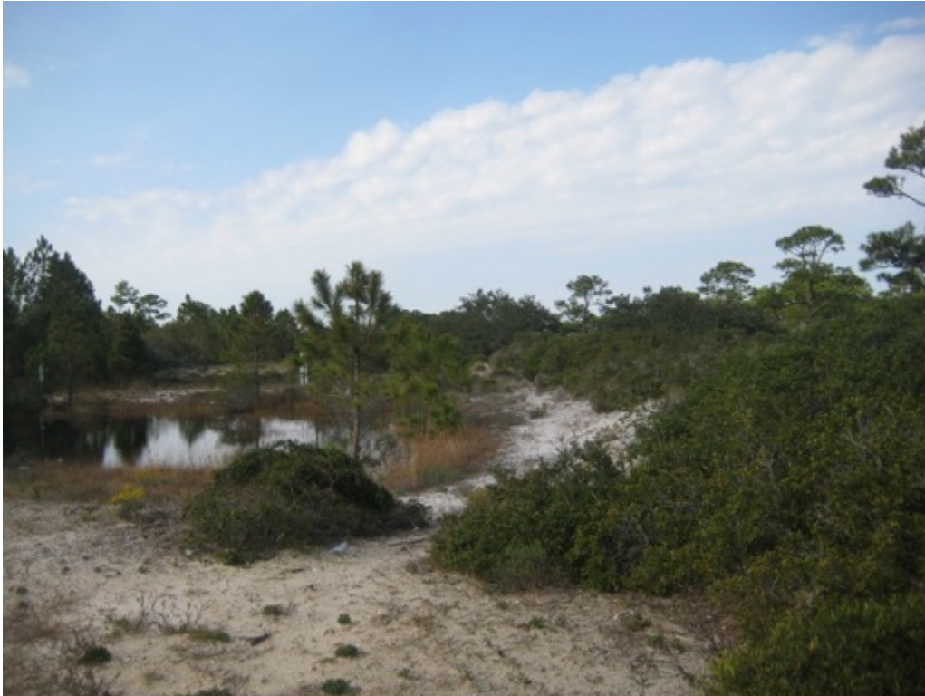
Photo 1 Looking west along northern property boundary