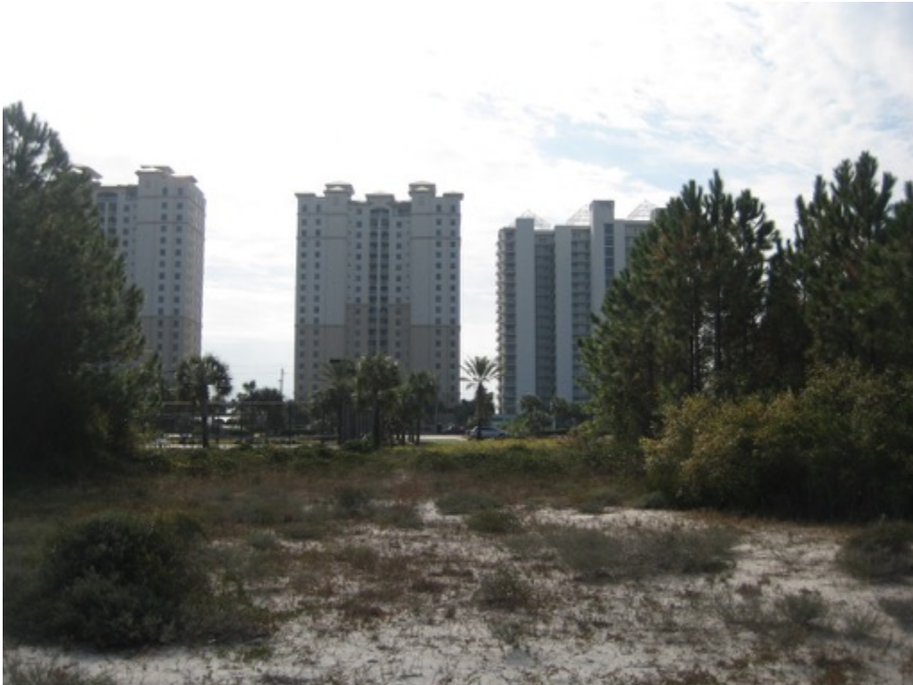
Photo 10 Looking south through western portion of property