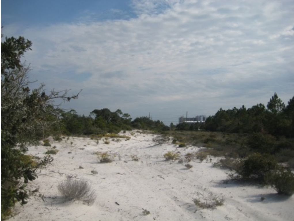
Photo 9 Looking east along northern property boundary