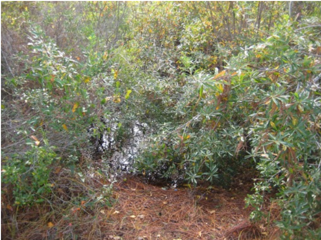
Photo 6 View of intra-dunal swale wetland from the northwest