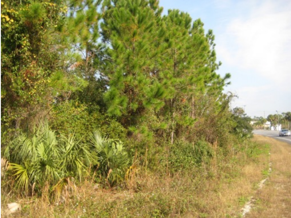
Photo 3 Looking northeast along eastern property boundary