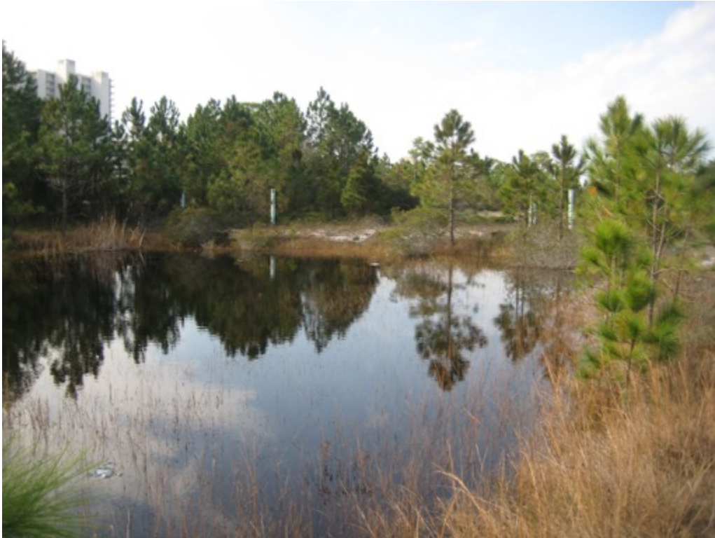
Photo 5 Looking west through eastern portion of site