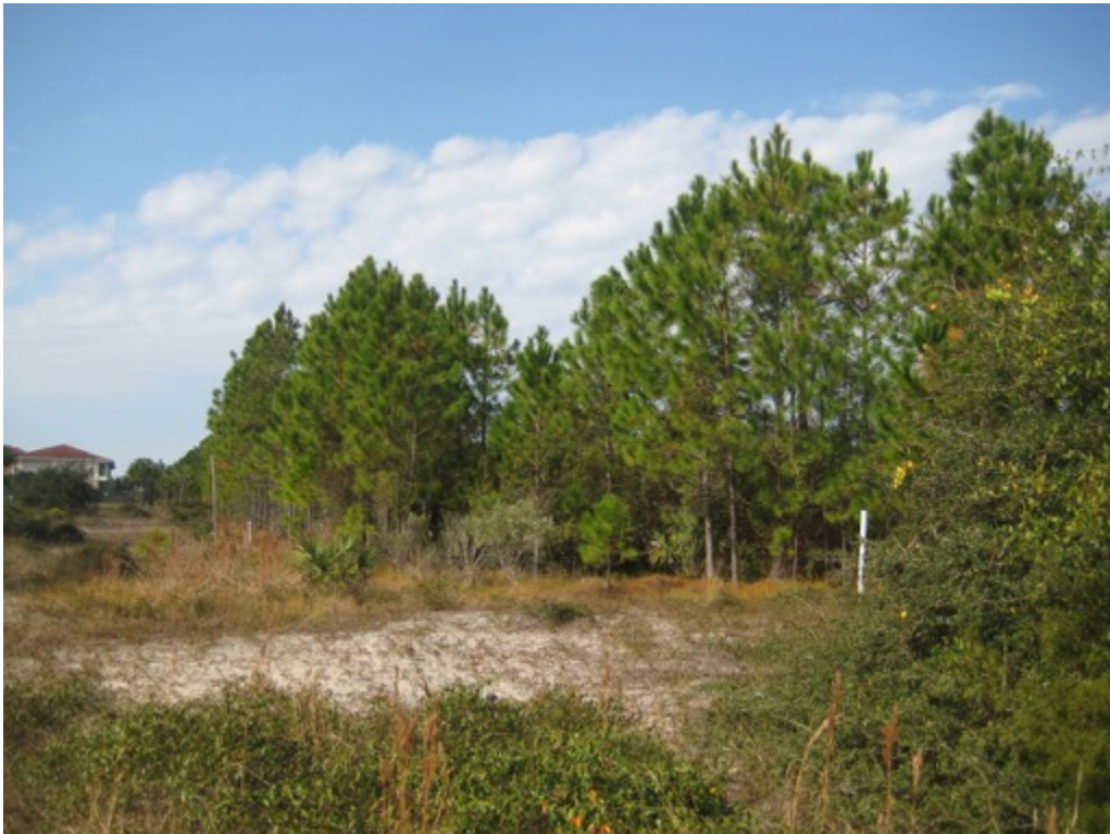
Photo 4 Looking west along southern property boundary