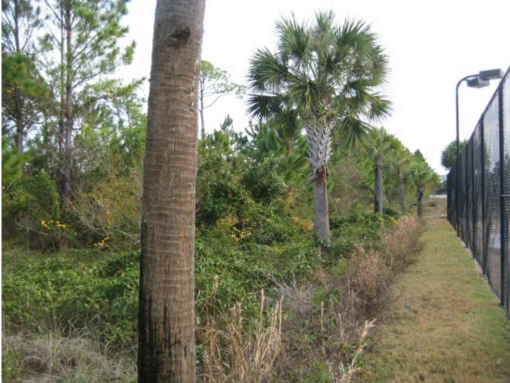
Photo 7 Looking east along southern property boundary