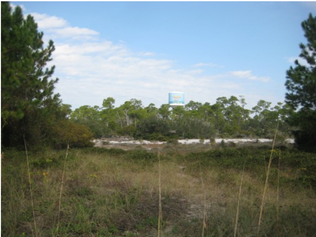
Photo 8 Looking north through western portion of property