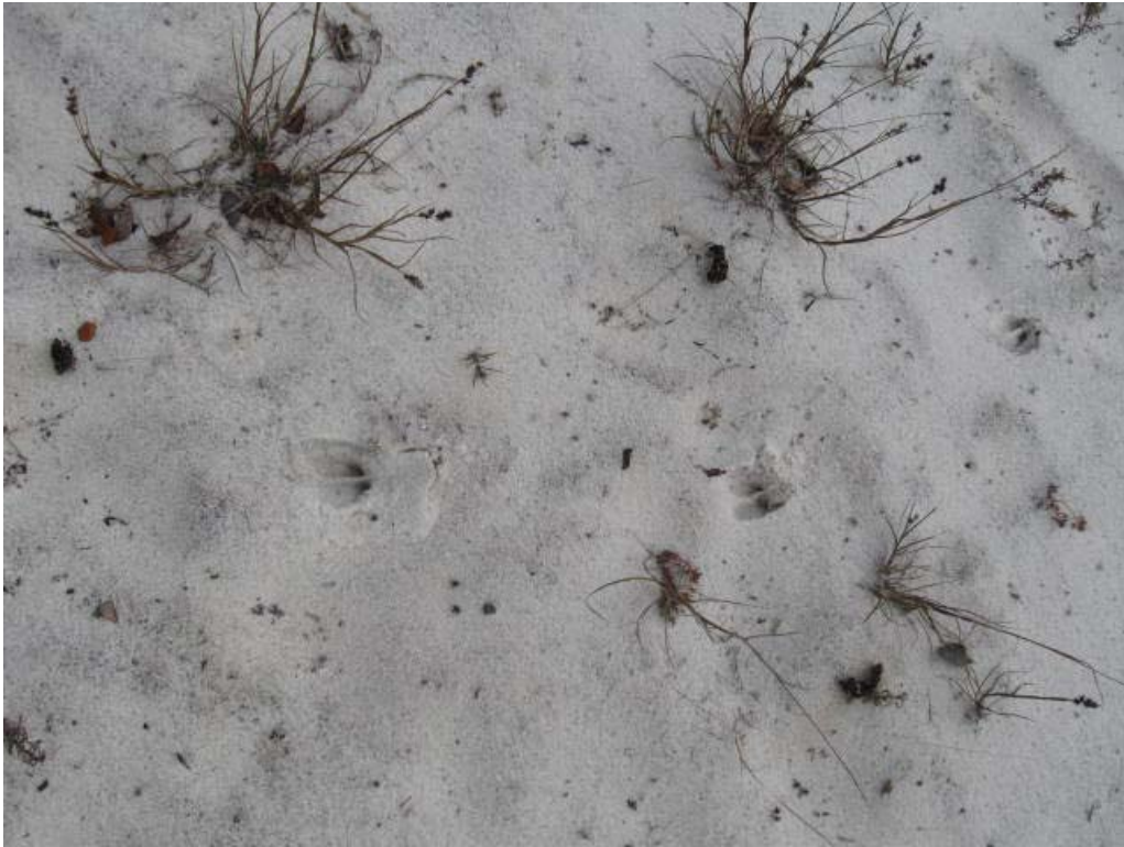
Photo 7 View of deer tracks indicating faunal utilization