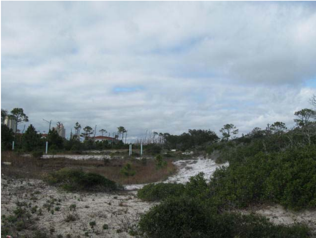
Photo 1 Looking west along northern property boundary