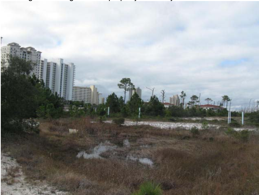
Photo 2 Looking southwest from near northeast property corner