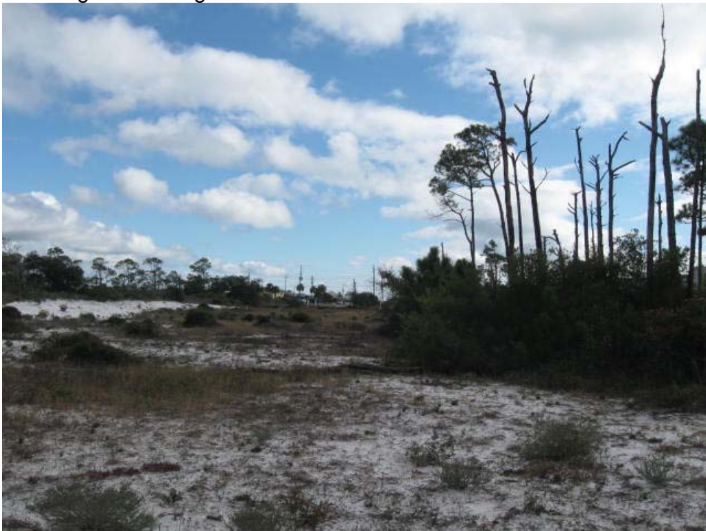
Photo 6 Looking east through northern half of site