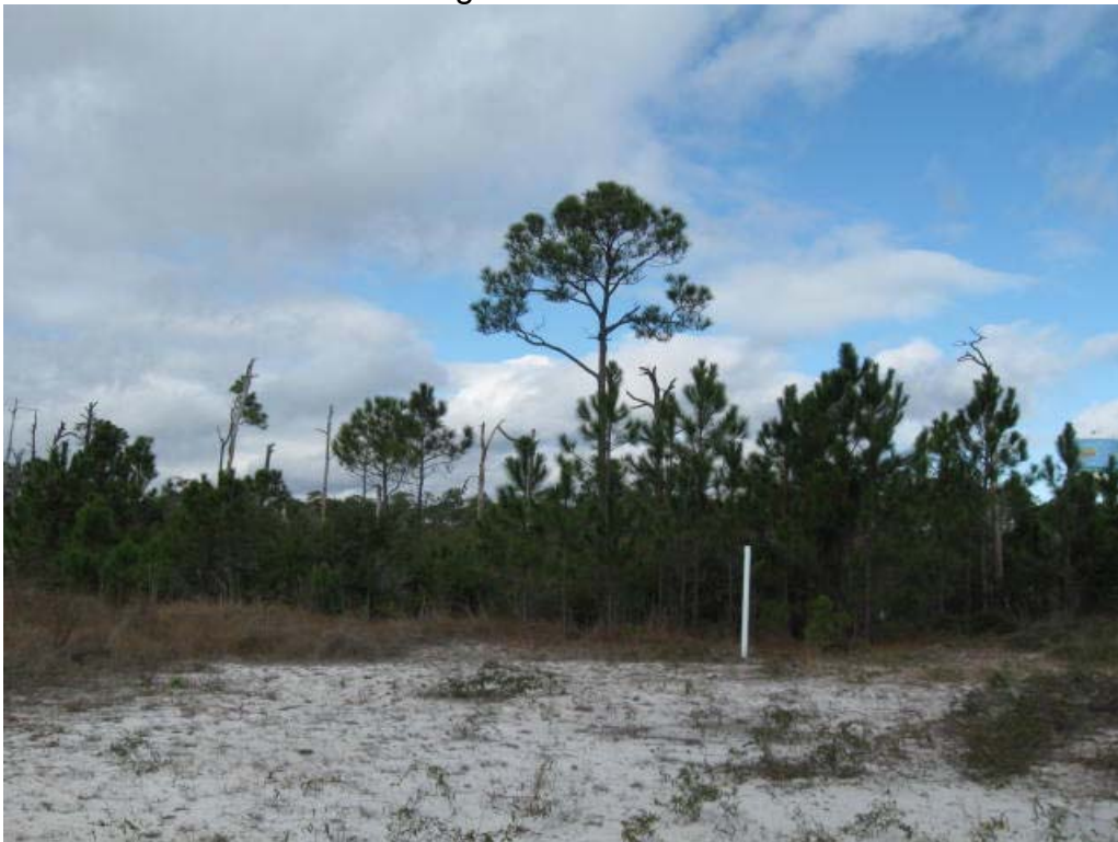
Photo 8 Looking southeast through the intradunal swale ecosystem on-site