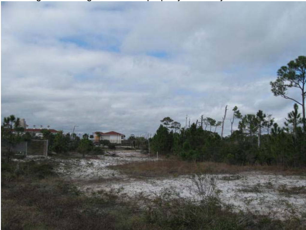
Photo 4 Looking west along southern property boundary