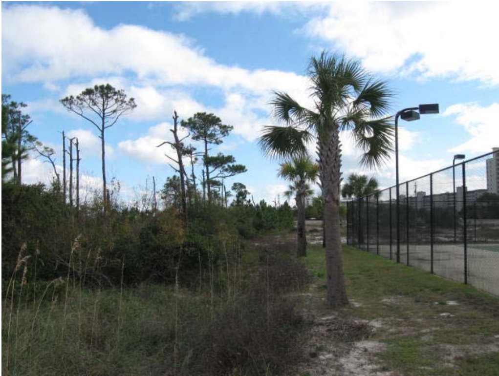
Photo 5 Looking east through southern half of site