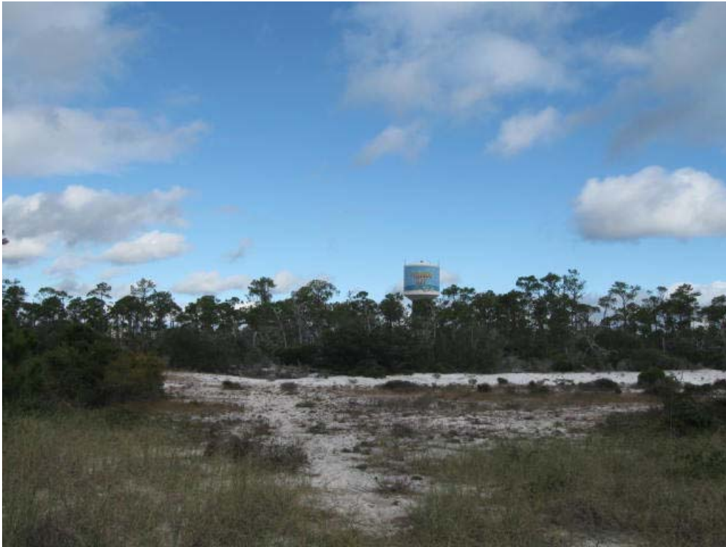
Photo 3 Looking north along the western property boundary